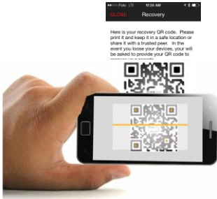
Secure Credentials Recovery using QR codes & voice recognition