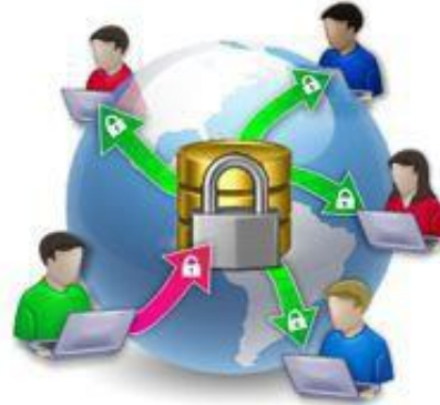
Secure Sharing between Users using public key cryptography