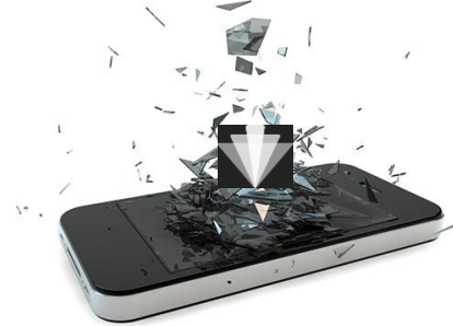
App remote Wipe Lost/stolen/sold devices