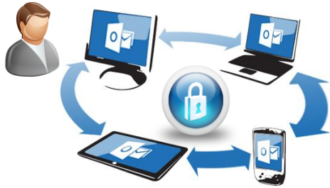
Secure Sync across User Devices using public key cryptography